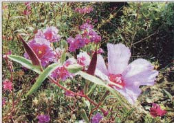
CLARKIA: This flower is planted in the oak savannah area at Acorn Naturalists, along with penstemon and California poppy.

Alpines are included in this group. Plants hunker near the rocks to find a cool root run,