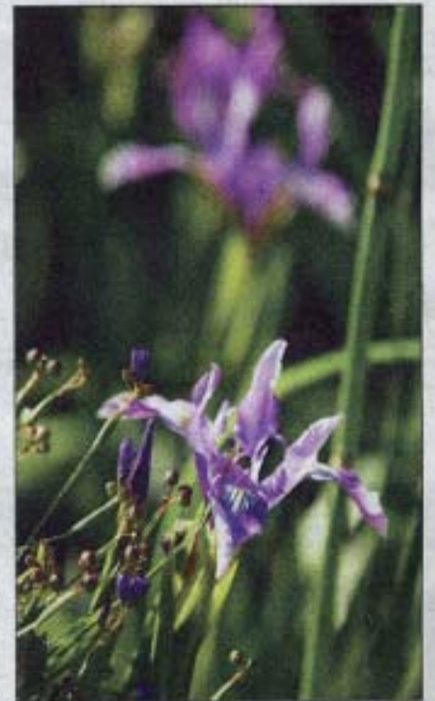
PURPLE PALS: Blue-eyed grass and Pacific Coast iris make good partners.